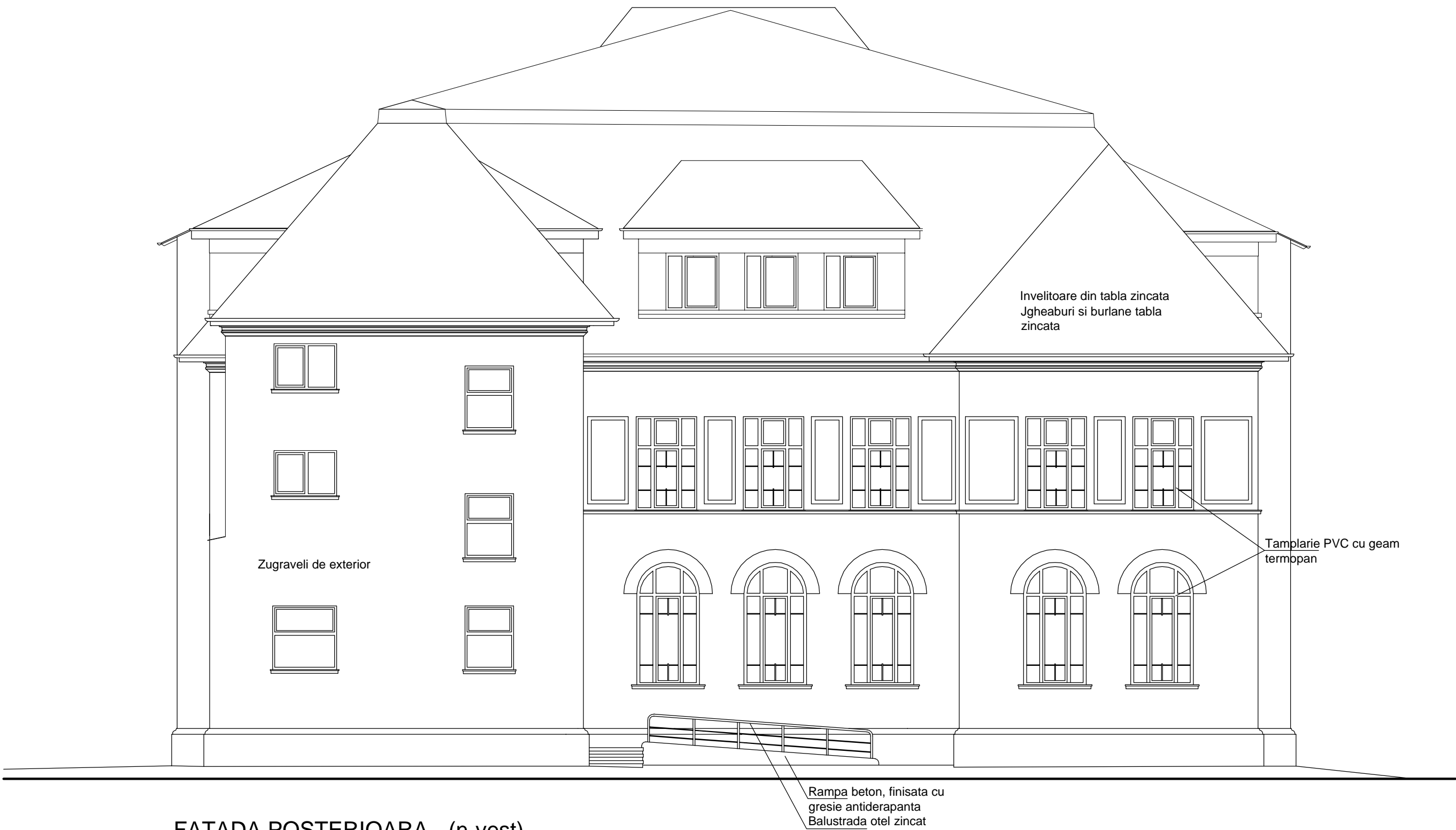
FATADA POSTERIOARA - (n-vest)