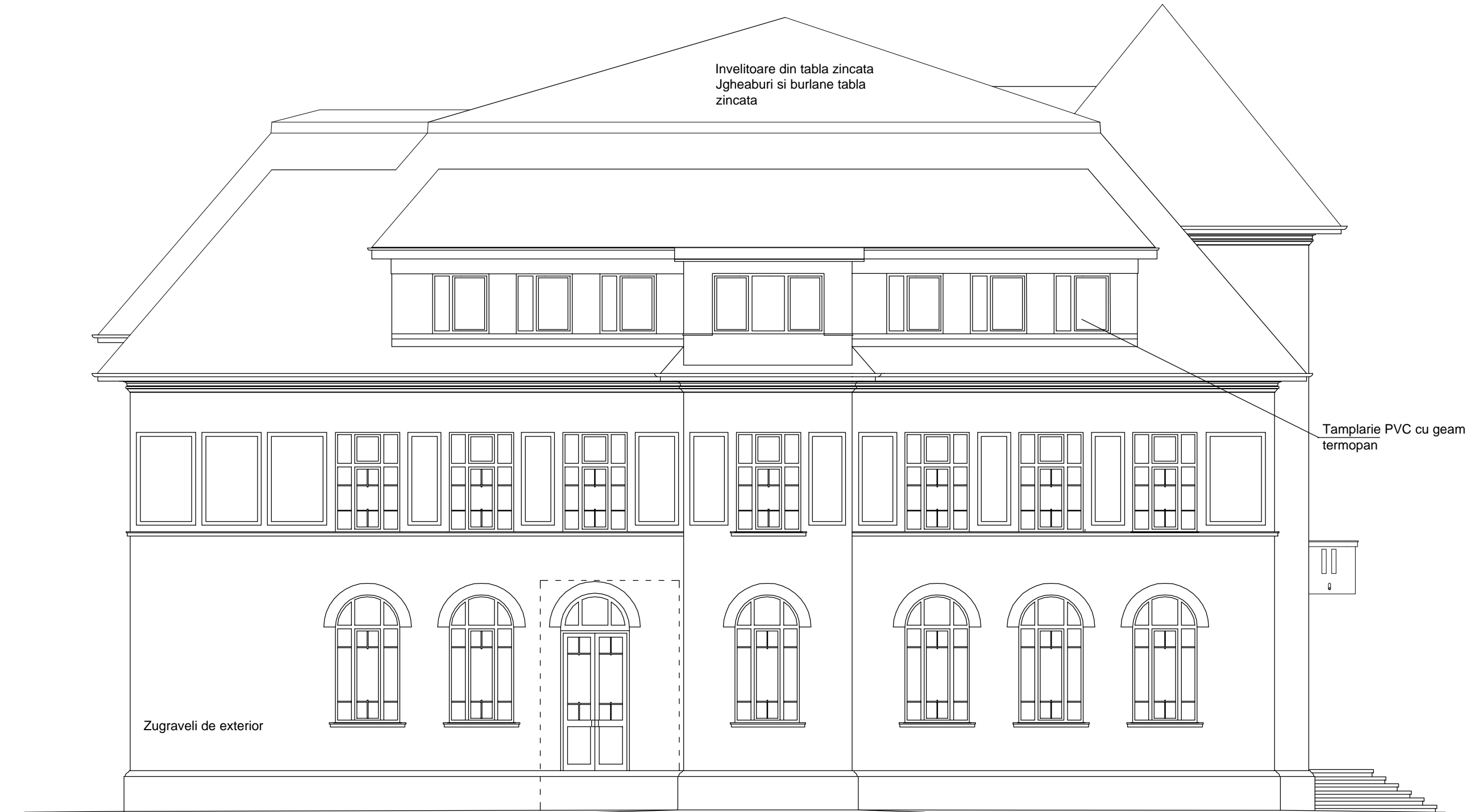
FATADA LATERALA - (sud-v)